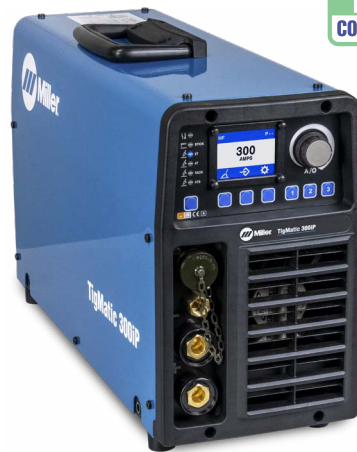
TigMatic® 300iP Machine only

• Eliminating the need to walk back to the machine to change parameters.