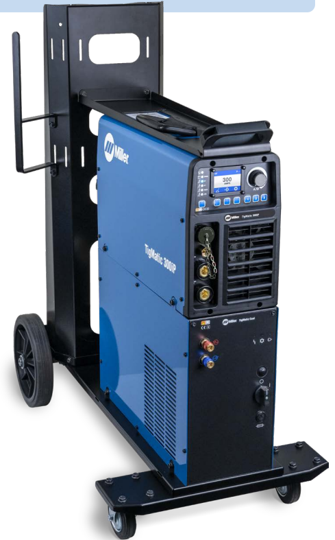
TigMatic® 300iP with Cooler and Trolley