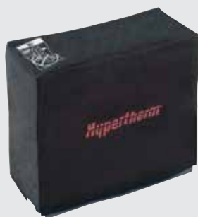
System dust cover