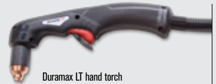
Duramax LT hand torch