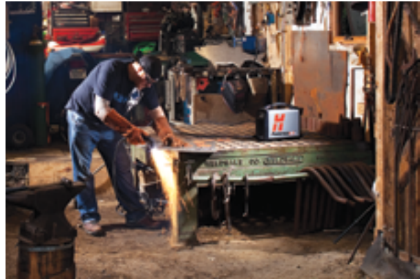
Home hobby and metal art

HVAC, agricultural, property/plant maintenance, fire and rescue, general fabrication, plus: