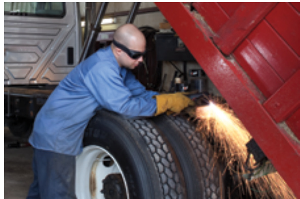
Vehicle repair and modification