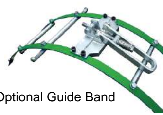
Optional Guide Band

The GB CUT F1 can cut & bevel pipes from 4" to 80" diameter. The torch is mounted in a holder which can be adjusted through 3 axes for perfect positioning. Triplex link chain and adjustable wheel positions enable the GBC CUT F1 to perform precise, square cuts.