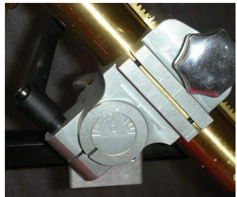
Adjustable torch holder

Available in manual or motorised versions. Motorisation kits can be fitted retrospectively.