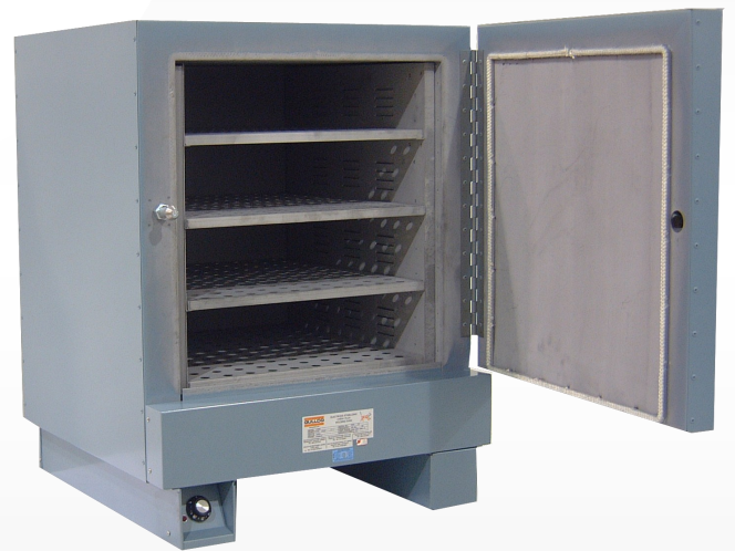
Model 1000 - for operation on 220/440 Volt, AC.