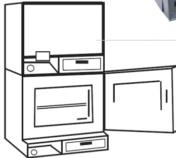
Compact And Stackable