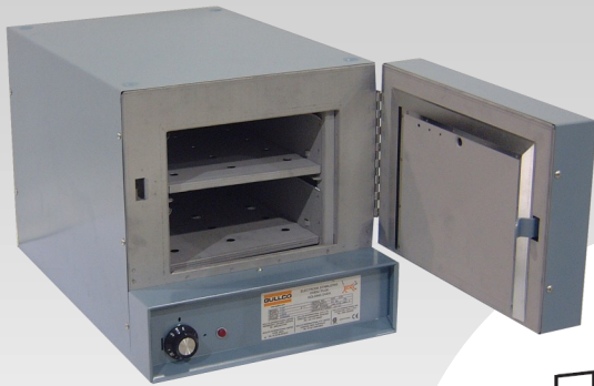
Model 125 - for operation on 115 or 220 Volt, AC.