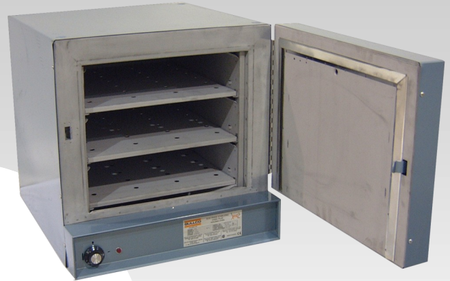
Model 350 - for operation on 115 or 220 Volt, AC.