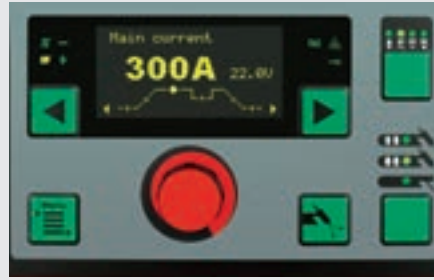
/ Control panel of MW 3000 Comfort