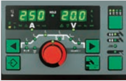
/ Control panel of MW 2500 Job