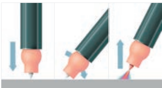
/ For sensitive areas of application: Touchdown ignition

/ The ignition plays a vital rôle in TIG welding. On each of the machines, ignition is possible either with or without touchdown. In non-contact ignition, the arc starts immediately with a high-voltage impulse, ensuring perfect ignition right from the first push of the button – even when you’re using extra-long hosepacks. Touchdown ignition is especially valuable in sensitive areas of application. And the important thing here is to make sure that there are no tungsten inclusions. The digital process control takes good care of this, perfectly controlling the entire sequence.