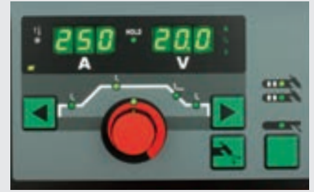
/ Control panel of TT 2500 Standard