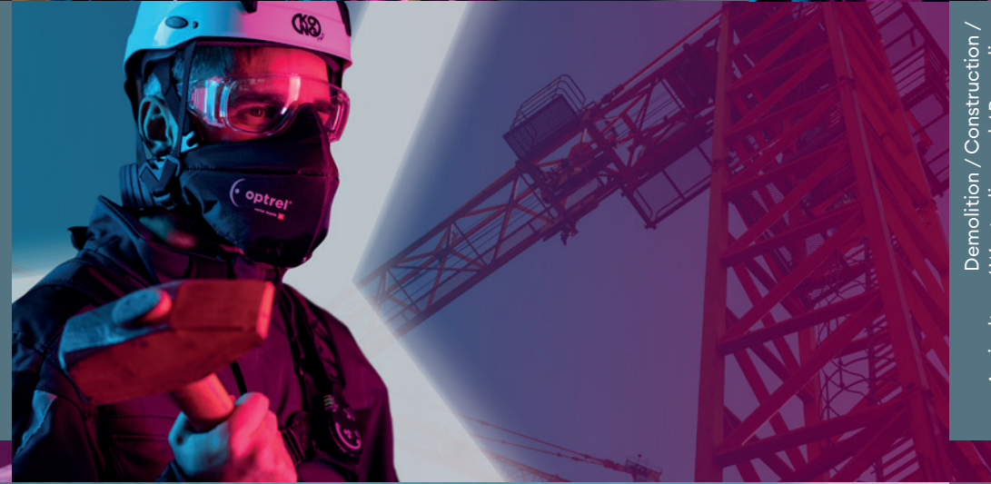
Demolition / Construction / Agriculture / Waste disposal / Recycling