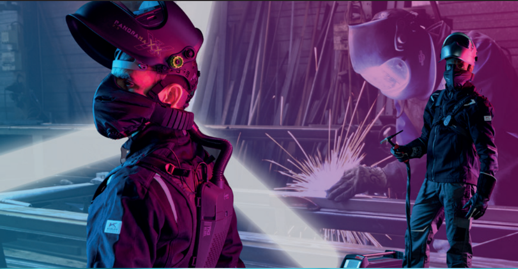
Welding / Plasma cutting