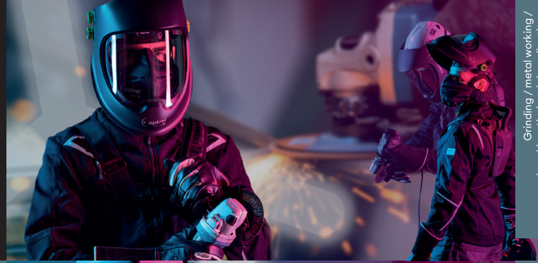
Grinding / metal working / wood working / industrial applications