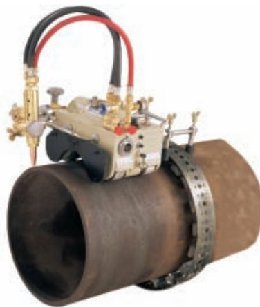
with Guide Band