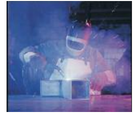
Without Fume Extraction