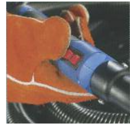
Up/Down Control module