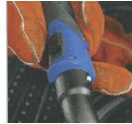
Air slide Top of the handle.