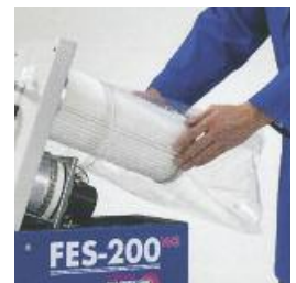
Changing the filter cartridge