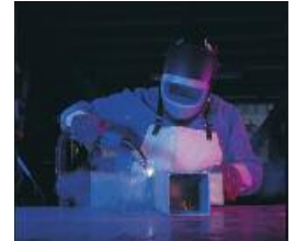
With Fume Extraction