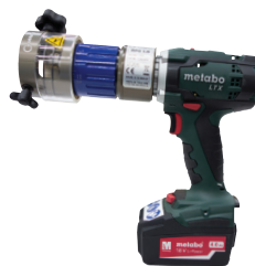
RPG 1.5 Cordless