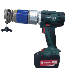
RPG ONE Cordless