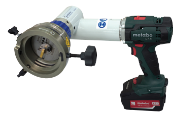
RPG 2.5 Cordless