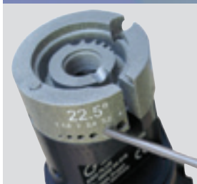
Grinding electrodes: 4 different angles and 6 different electrode sizes

One machine – complete electrode preparation!