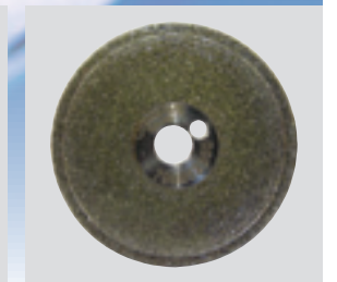
Exchangeable diamond grinding wheels for optimal performance