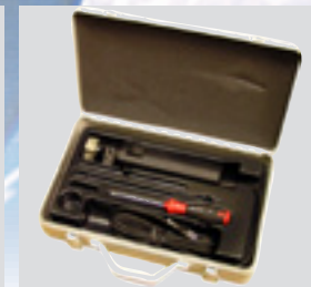
Durable storage and shipping case