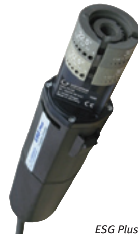
ESG Plus 2