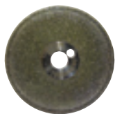
Diamond grinding wheels