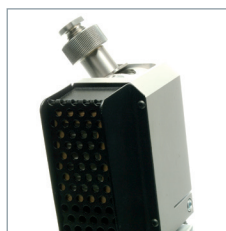
Integrated dust filter, that is easy to change.