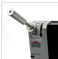
Adjustable tip angle from 15-180°.