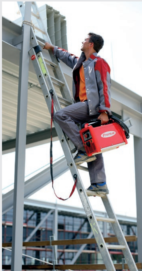
/ Lightweight and portable, and so right at home on every worksite.