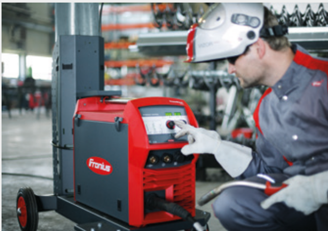
/ Very easy to operate, digitally controlled, with 'on-board' expert knowledge