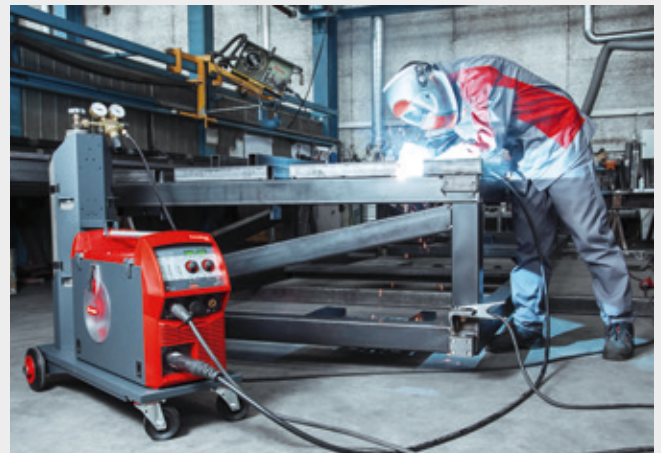
/ TransSteel 2500 Compact – the space-saving, powerful alternative for workshop operations