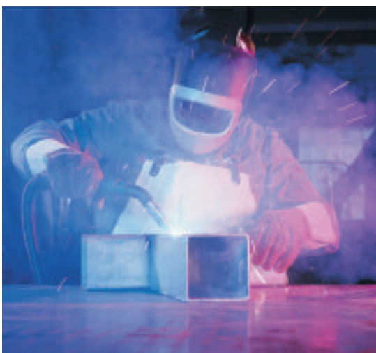
RAB Plus without fume extraction