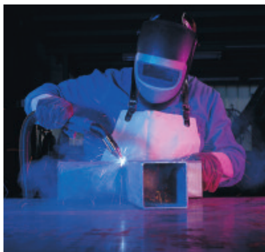
RAB Plus with fume extraction