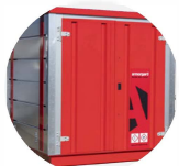
Forma-Stor COSHH FR200-C