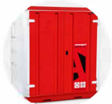
Forma-Stor COSHH FR100-C