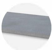
FSC2 shelf SHE-C2