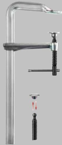
Original BESSEY all-steel screw clamp GZ with tommy bar