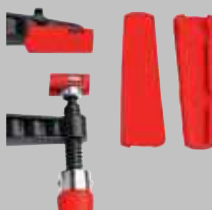
Pressure cap strips SKS (2 pcs./bag)