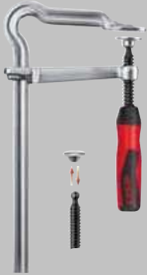
OMEGA screw clamp GMZ with 2-component plastic handle