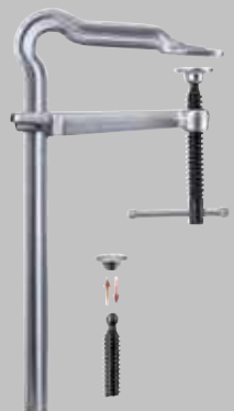
OMEGA-screw clamp GMZ with tommy bar