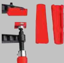
Pressure cap strips SKS (2 pcs./bag)