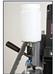
Coolant bottle assembly