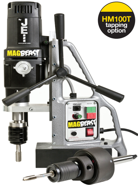
HM100T tapping option

Durable, heavy duty 3 morse taper drilling machines with tapping or swivel base options