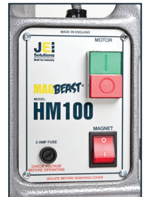
Simple operating panel