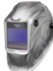
VIKING™ Heavy Metal®