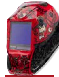
VIKING™ 3350 Mojo™