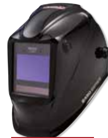
VIKING™ 2450 Black

WHAT'S INCLUDED: Comes with helmet bag, bandana, 5 outside cover lenses, 2 inside cover lenses and sticker sheet.