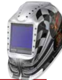
VIKING™ 3350 Motorhead™