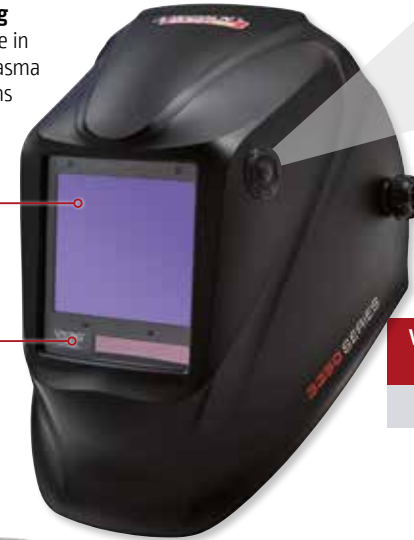
VIKING™ 3350 BlackMat