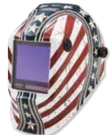
VIKING™ 3350 Dardevil