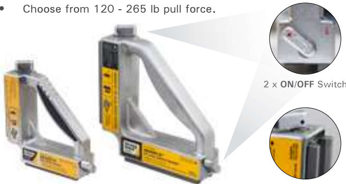
2 x ON/OFF Switch