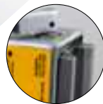
V-Groove For holding round & flat stock.