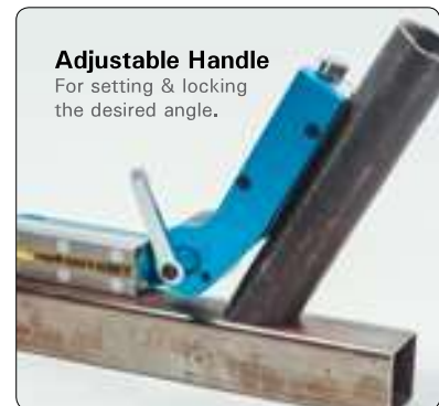
Adjustable Handle For setting & locking the desired angle.