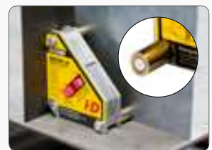
Holding a 3-Axis workpiece.