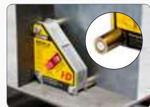
Holding a 3-Axis workpiece.