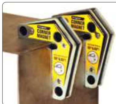
The compact and low profile Corner Magnet is ideal for light duty holding of stock at 90°.