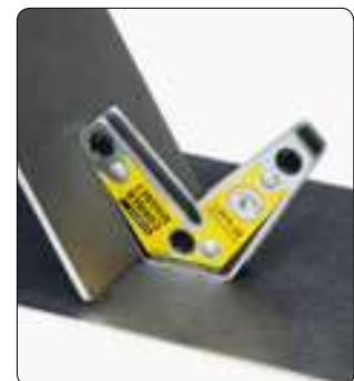
Use the outer edges of the Corner Magnet to hold stock at 120°.