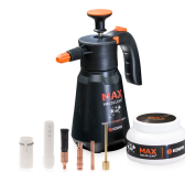
MAX WeldClean Starter Kit, small

Optional on-torch remote control with a rocker type current control switch. Available for water and gas-cooled Flexlite torch models.