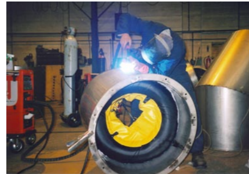
Rapid Purge used to weld a stainless steel elbow.

Standard sizes 8 to 80" are available in large quantities for immediate delivery from stock. Special sizes are available within 7 days.