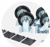
Castor kit CAS160-KS-FX-SB-CP