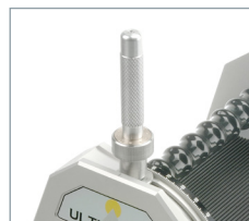
Tip may be flattened by 1/10 mm per point in the 90° position.