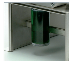
Sealed disposable container for dust collection and disposal.