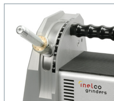
Grinding angle from 7.5 - 90° creates accurate electrode tip angles of 15 - 180°.